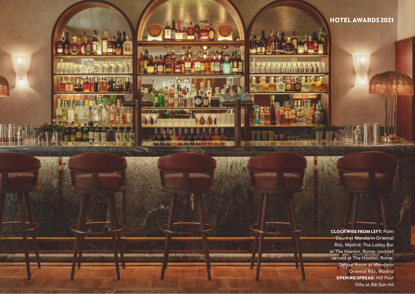
CLOCKWISE FROM LEFT: Palm Court at Mandarin Oriental Ritz, Madrid; The Lobby Bar at The Hoxton, Rome; cocktail served at The Hoxton, Rome; Deluxe Room at Mandarin Oriental Ritz, Madrid OPENING SPREAD: Hill Pool Villa at B&B San Hô