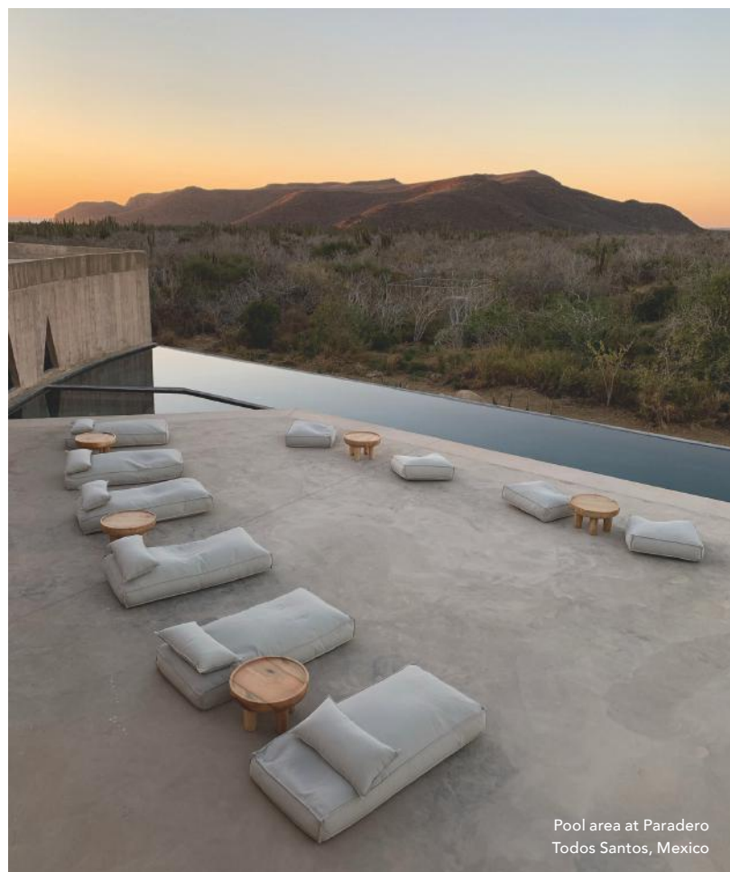
Pool area at Paradero Todos Santos, Mexico

Two hours northwest of Tokyo in Maebashi, a 1970s high-rise has been merged with a Teletubbies -esque grassy knoll. Of the 25 rooms, four were specially designed by a roster of international creatives. There's top-notch food at the cafe and restaurant, an art tour and also a Finnish sauna. From £425, full board. shiroiya.com