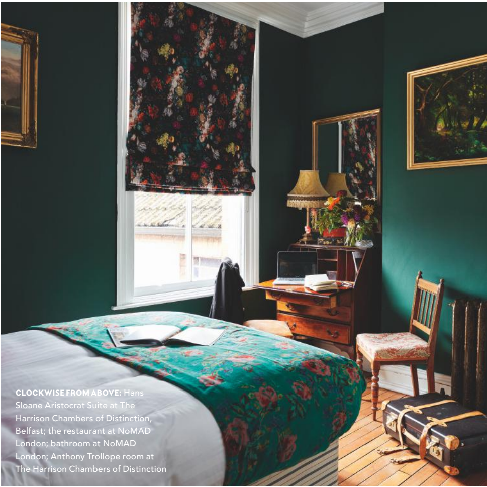
CLOCKWISE FROM ABOVE: Hans Sloane Aristocrat Suite at The Harrison Chambers of Distinction, Belfast; the restaurant at NoMAD London; bathroom at NoMAD London; Anthony Trollope room at The Harrison Chambers of Distinction