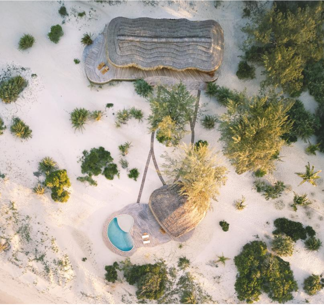
FROM LEFT: Aerial view of Kisawa bungalow, at Kisawa Sanctuary, Mozambique; bathroom at Kisawa Sanctuary, Mozambique; bedroom at Can Ferrereta, Majorca

With Ottoman-inspired rooms and a garden peppered with Roman relics, there was much anticipation for Nabil and Zoe Debs’ new hotel. But the explosion in the Lebanese capital’s port last summer brought the Gemmayze district to its knees. Arthaus has already partially reopened, with its 25 rooms complemented by a concierge service. From $320 (£230). arthaus.international