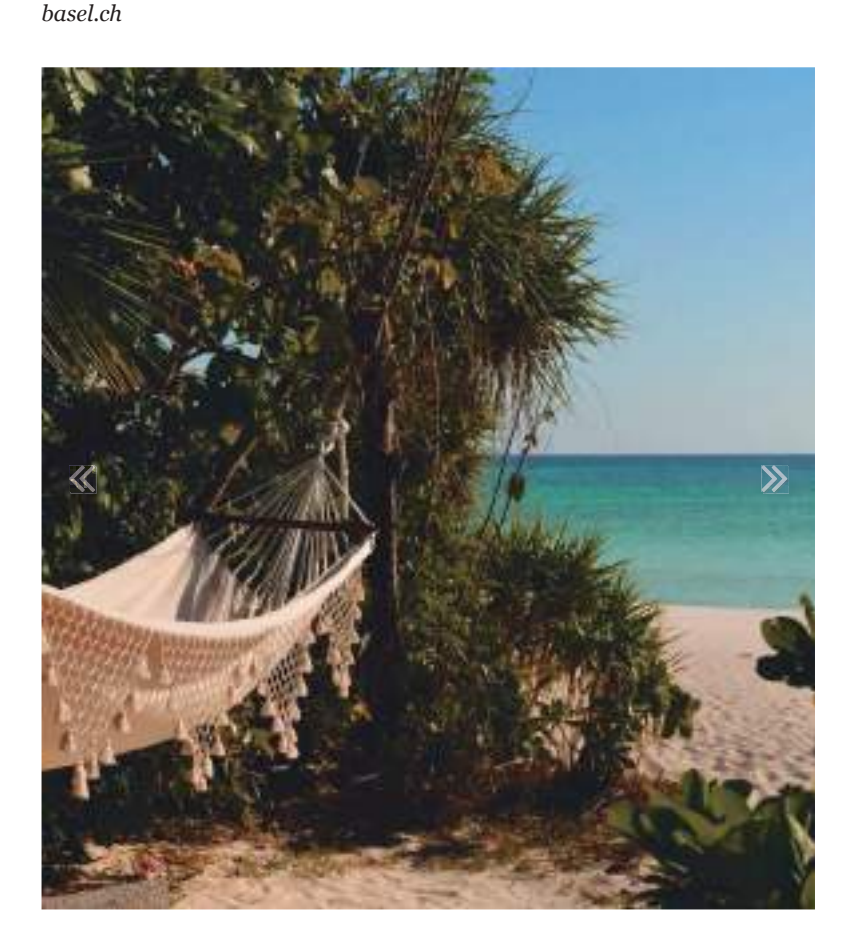
14. Amanpulo / Philippines Set in the natural seclusion of Pamalican Island's idyllic landscape, Amanpulo's Casitas and Villas are serenely set on the beachfront or ensconced

The Volkshaus Basel Hotel is designed for the individuality and needs of its guests creating an urban place of relaxation and modern hospitality in the middle of Basel's liveliest district. A thick wall of storage space lining the corridors was used to enter the hotel rooms and to accommodate closets as well as toilets and showers. Both facilities are integrated into the stained black oak wood closet that runs the entire length of the room. To implement this idea, the shower has to jut out slightly, thus rhythmically structuring the corridor. Ceramic tiles, glazed black and dark green, underscore the feeling of being enveloped in these two spaces, which have been inserted into the closets with meticulous precision. Oval windows, like those in the brasserie and bar, afford a view into and above all out of the shower and toilet. In most of the rooms, the shower has been positioned to allow a view straight through the room and thus out of the window as well. The rest of the space is unobstructed, divided only by a central shaft clad in black glass, which also forms the back wall of the freestanding washbasin. Address Rebgasse 12-14, 4058 - Basel, Switzerland www.volkshaus-