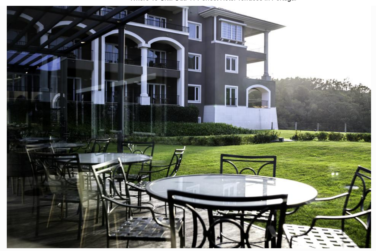
A terrace at Penha Longa Resort