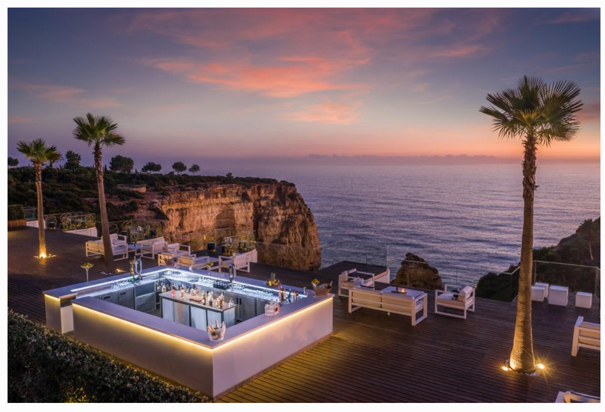
The Sky Bar at Tivoli Carvoeiro TIVOLI HOTELS

This luxury hotel at the edge of Principe Real and Bairro Alto has lovely views over the historic city center and the Tagus river. The Lumi Rooftop terrace was fully renovated during the first lockdown with stone tables from Sintra and yellow bougainvillea. It opens today with new cocktails, weekend brunch and new menu items like gazpacho, lamb kofta skewers, oxtail croquettes and spicy chicken wings with smoky mayonnaise.