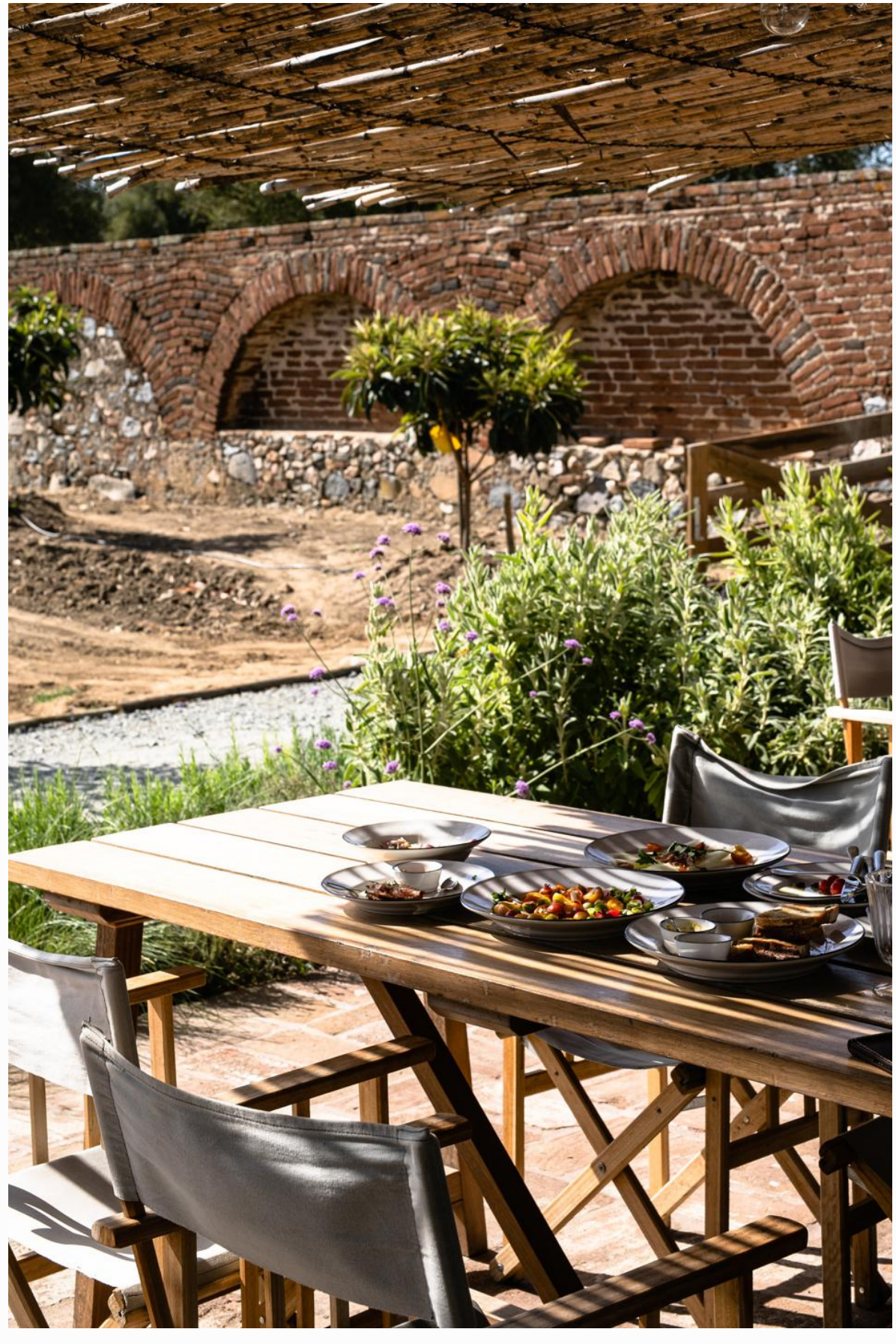
Hortelão at São Lourenço do Barrocal SHE IS VISUAL