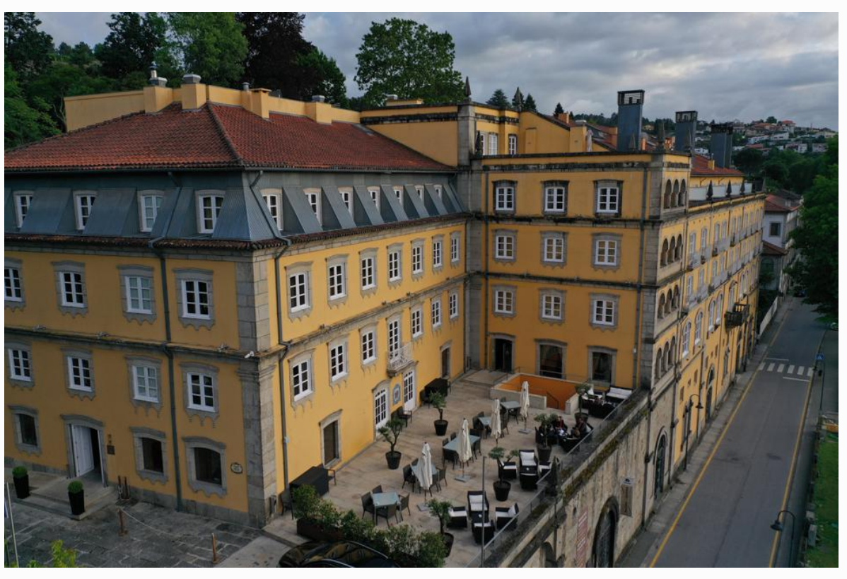
Casa da Calçada

The rooftop terrace at this design-forward small hotel faces the striking-looking old university. It has 360-degree views over the city, the river, and the university's courtyard, tower and famous Joanine Library. By night, it's illuminated by the stars. They plan to reopen in May.