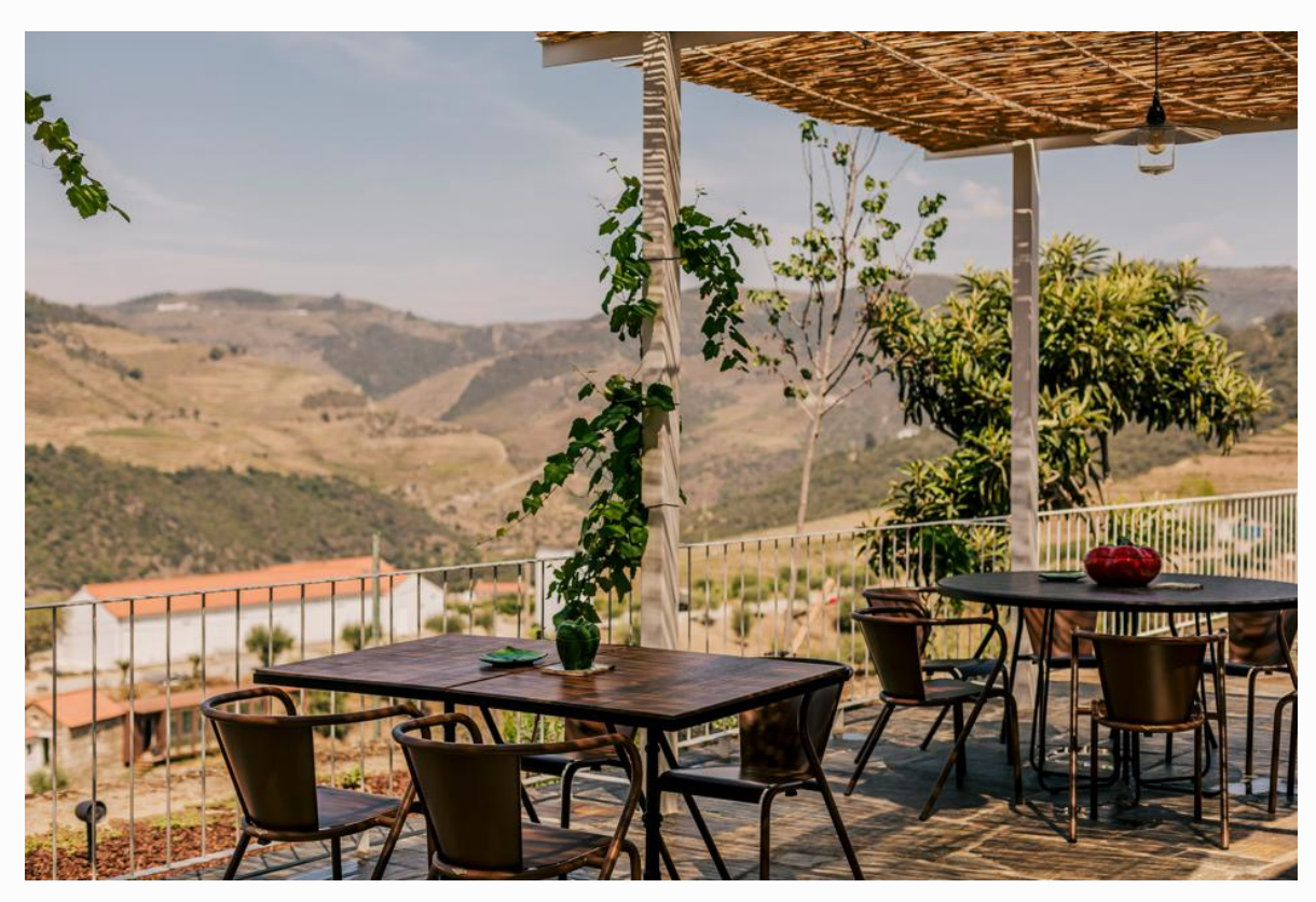
Ventozelo Hotel & Quinta Luis Ferraz / Quinta Ventozelo

Now that tourism is restarting, everything from alfresco breakfast to afternoon tea to sunset cocktails in the open air is fair game. Here are 11 hotel terraces worth booking a trip for.