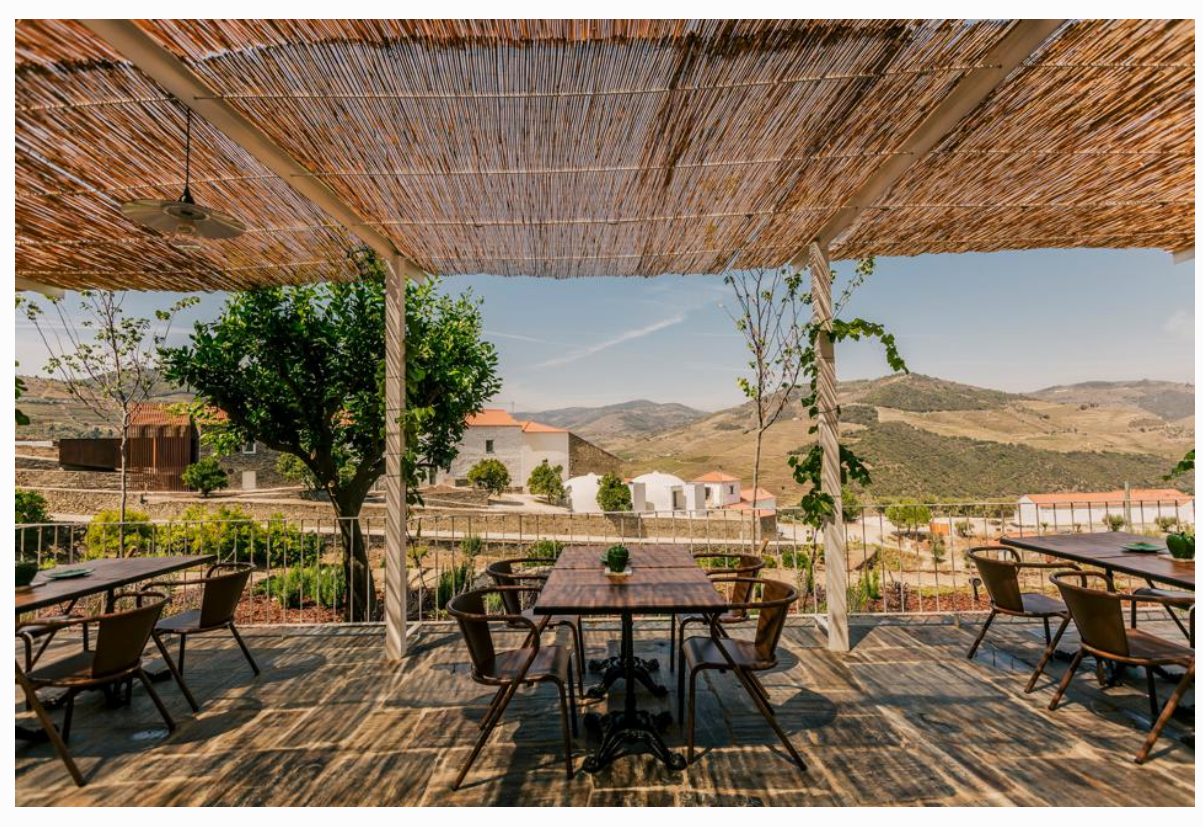
The terrace at Ventozelo Hotel & Quinta

I know the difference between expensive travel and the truly luxurious