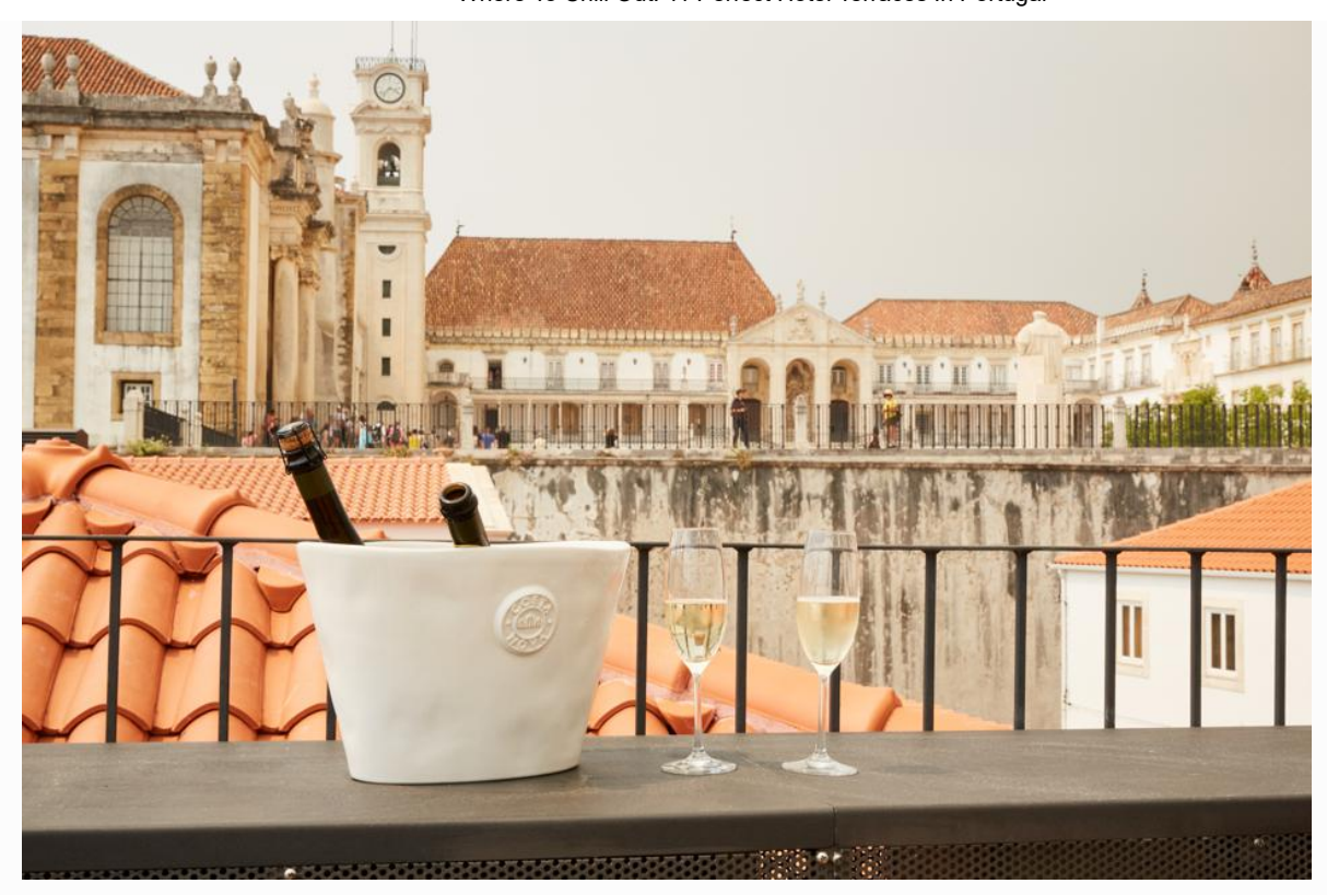
Sapientia Boutique Hotel