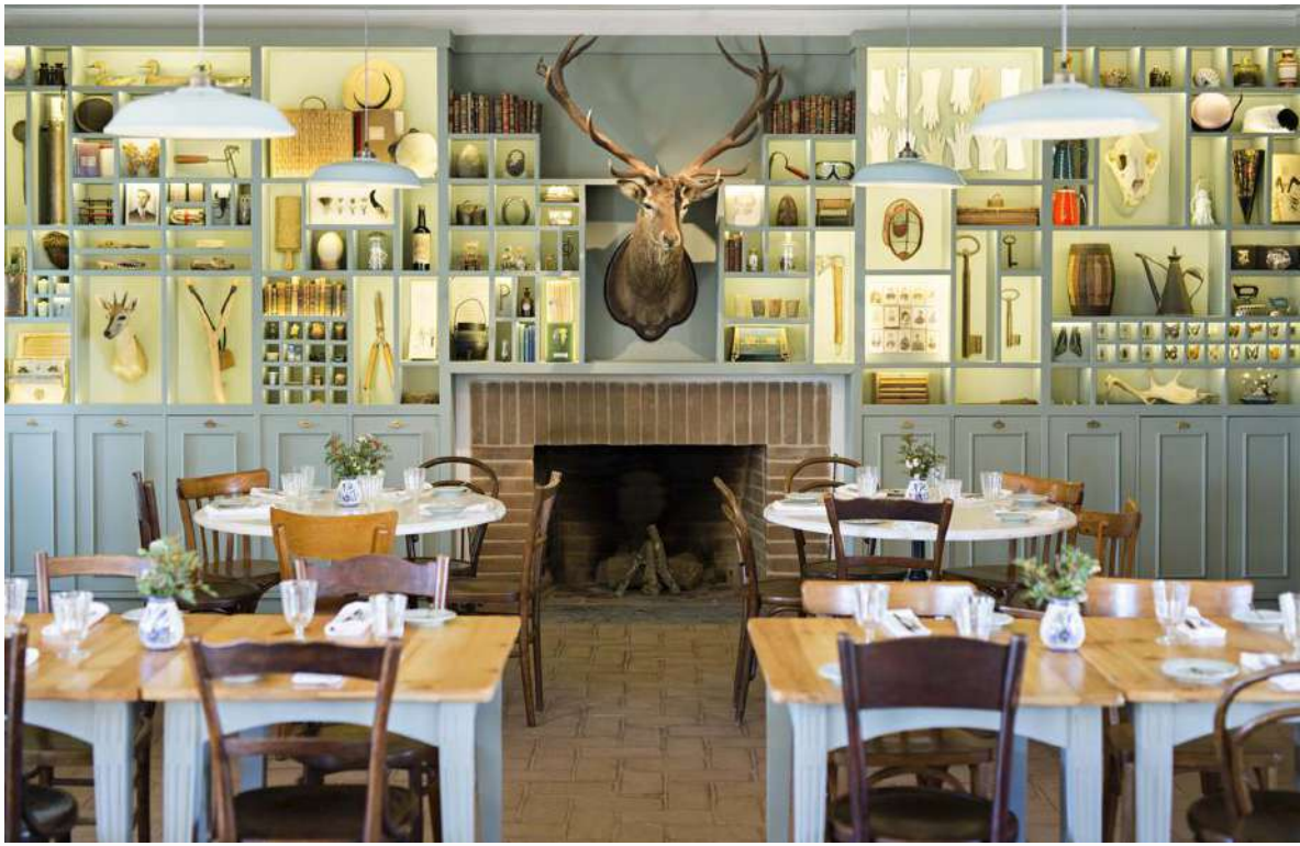
São Lourenço do Barrocal NELSON GARRIDO