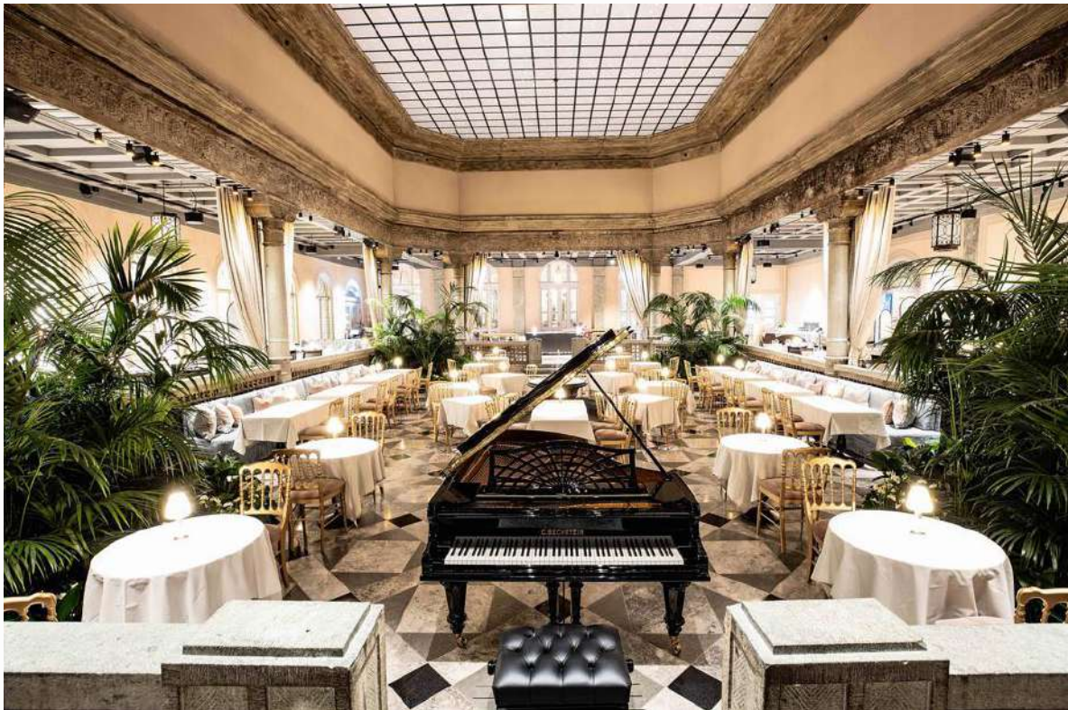
Palmehaven at the Britannia Hotel

Here (in alphabetical order) are my favorite discoveries of a very weird year.