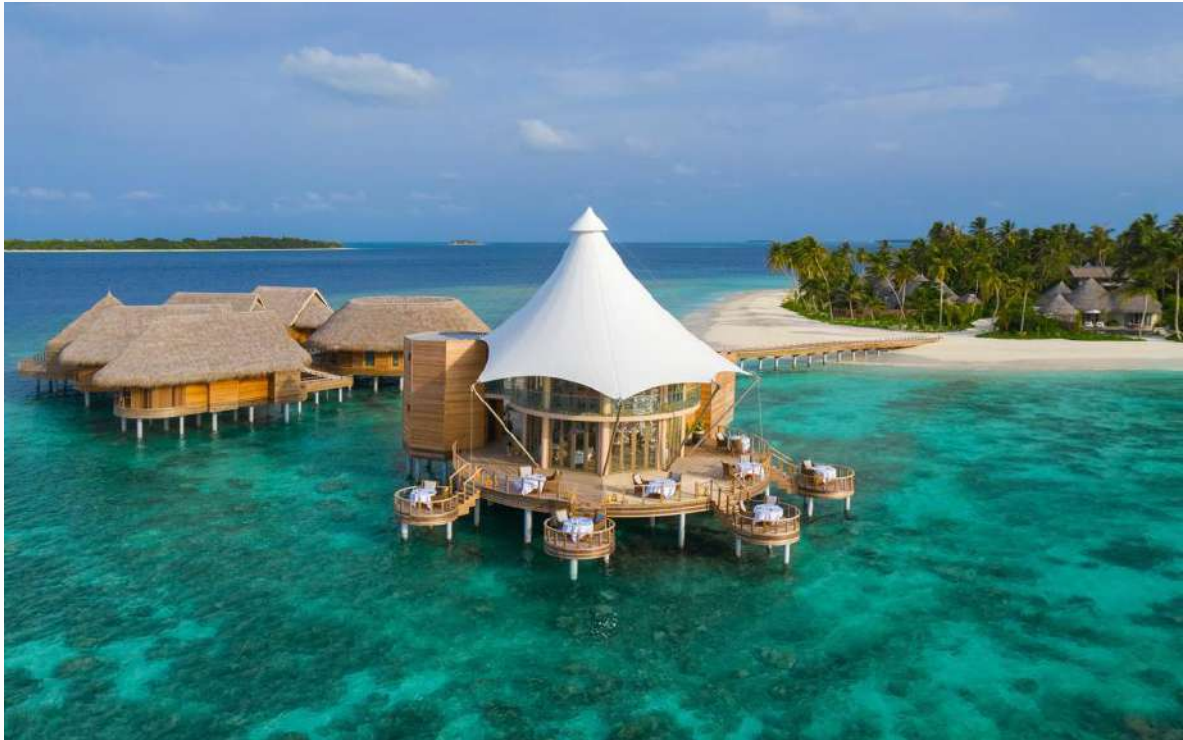
The Nautilus

the city's water canals. Over the years, it was called the Rescue Tower or the Cupboard Tower, and then eventually the Devil Tower because of its mysterious story. But there's nothing to fear. Inside, the three rooms are as comfortable and well appointed as can be.