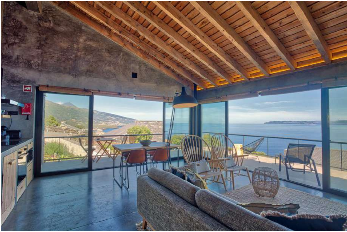
A house at Lava Homes