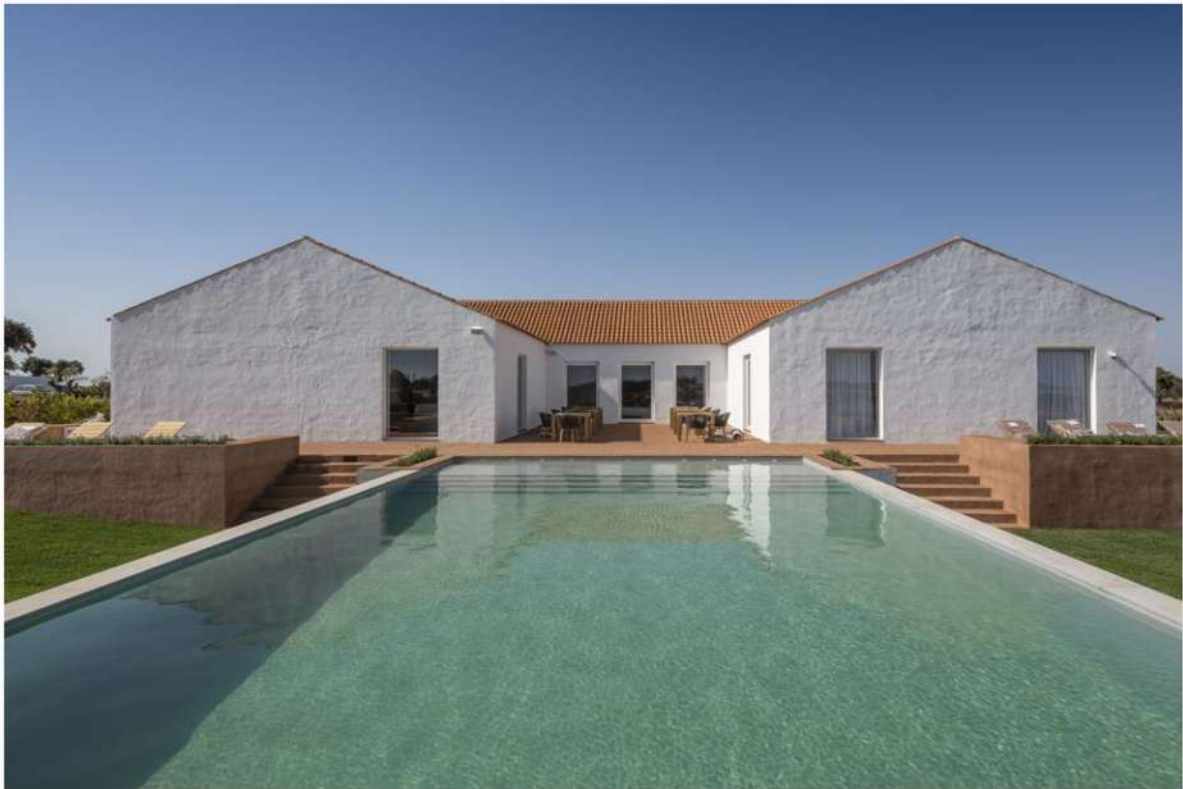
Casa do Acoradouro at Herdade da Malhainha Nova in Portugal

I know the difference between expensive travel and the truly luxurious