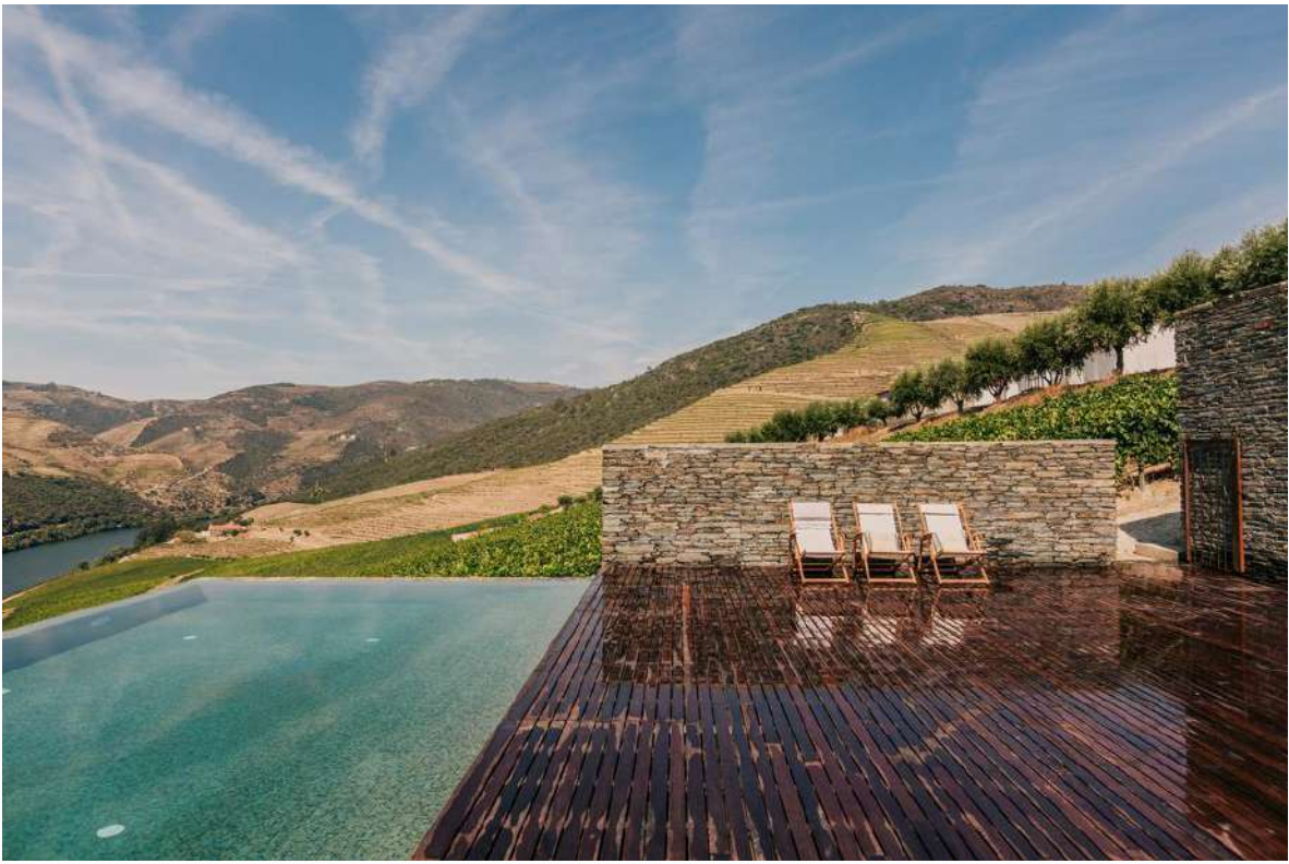
Ventozelo