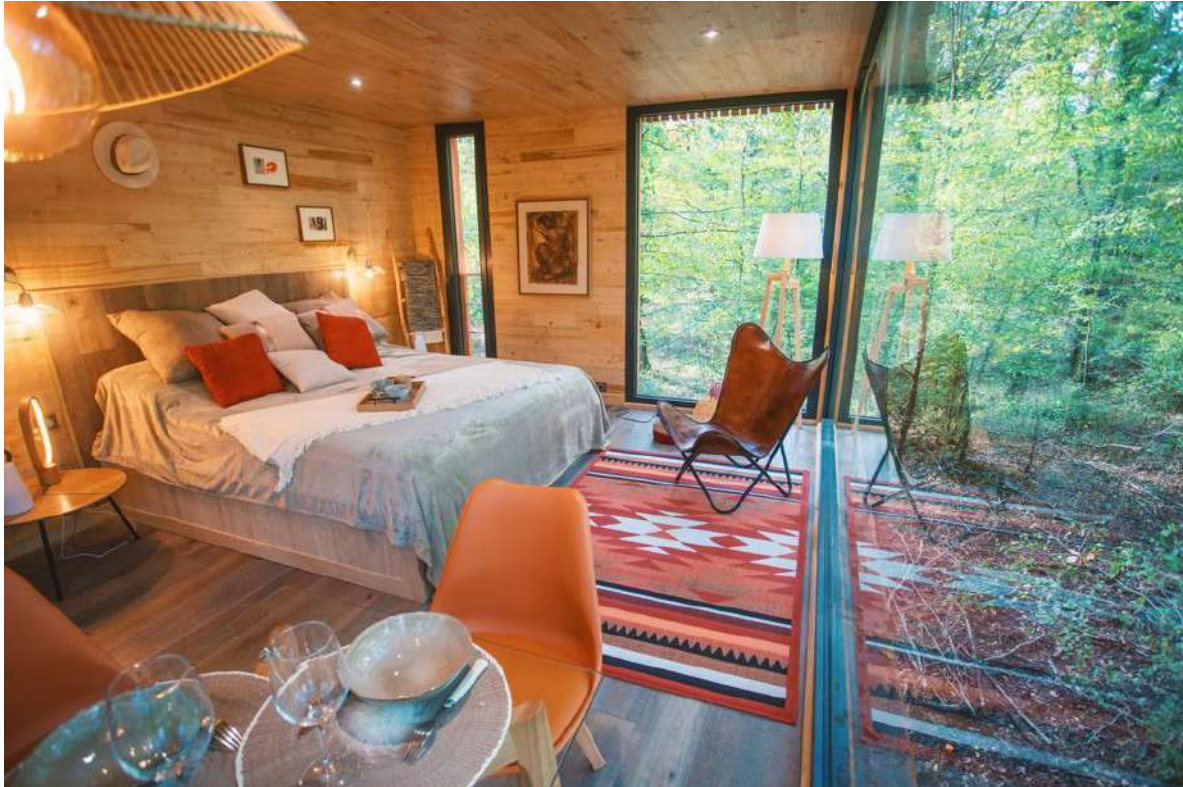
Loire Valley Lodges

meant to be another house or two that she could rent on Airbnb. But the government would only approve the deal if she made a resort. In short order she got ten friends to invest in the project, and Lava Homes was born, but it still has the feel of being welcomed into the home of a friend with very good taste. The houses have a beguiling mix of farmhouse, contemporary and traditional furnishings, not to mention excellent views at every turn.